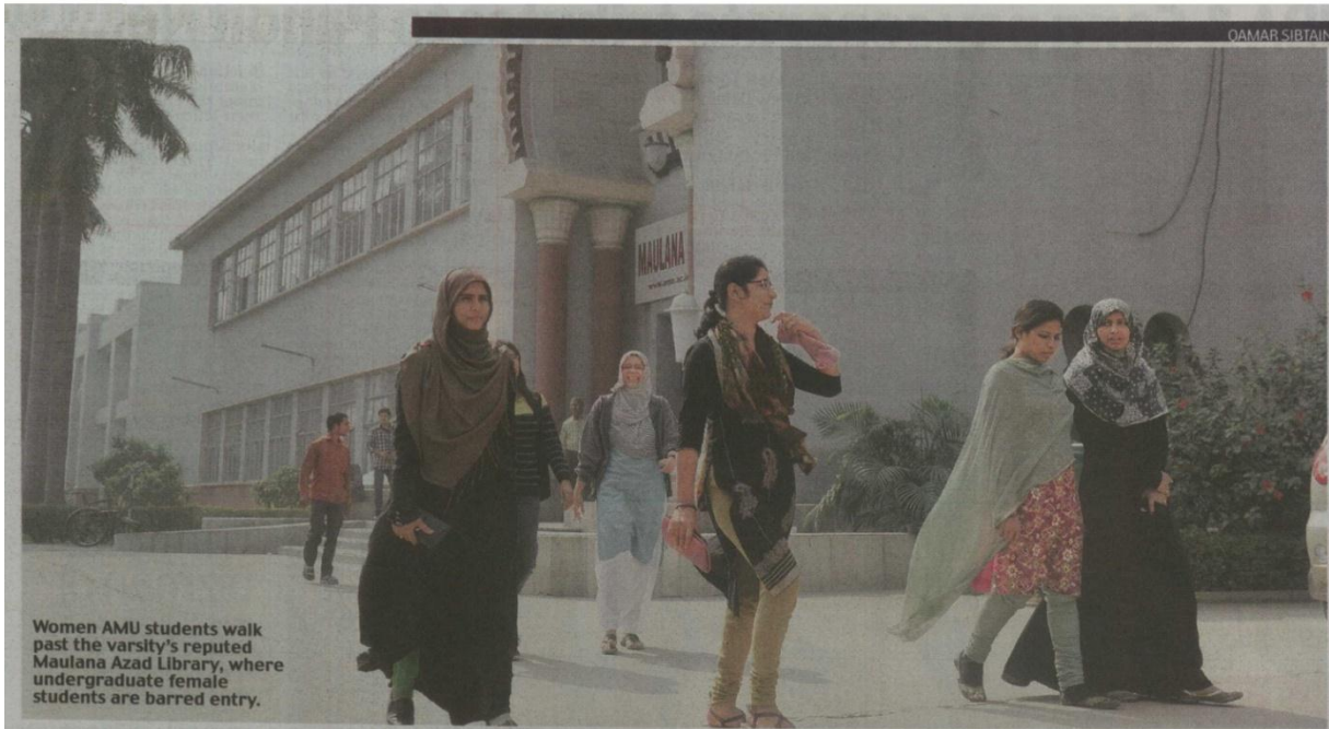
Women AMU students walk past the varsity's reputed Maulana Azad Library, where undergraduate female students are barred entry.